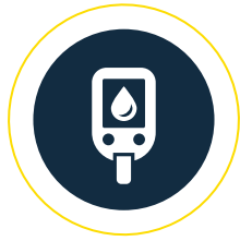
TYPE 2 DIABETES

Lack of sleep is linked to several chronic diseases and conditions, including: